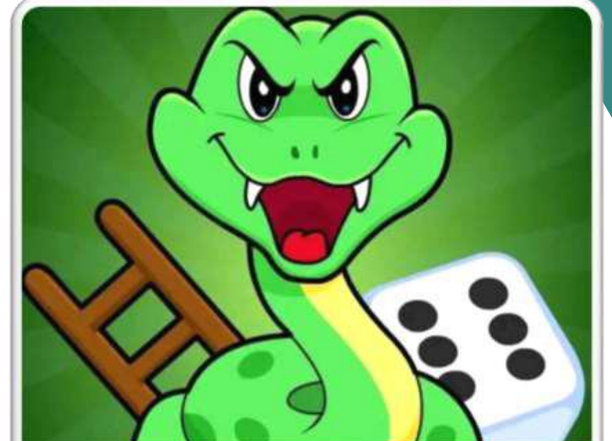
SNAKE & LADDER