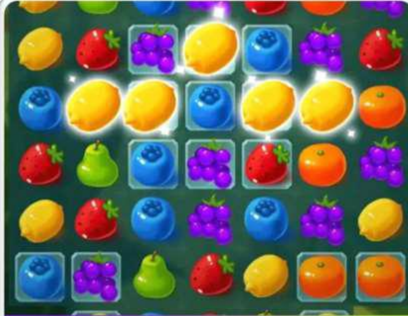
SWEET CANDY SAGA